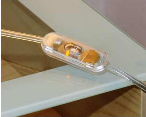
A real world record: The smallest network-compatible cable dimmer with Digitalstrom.