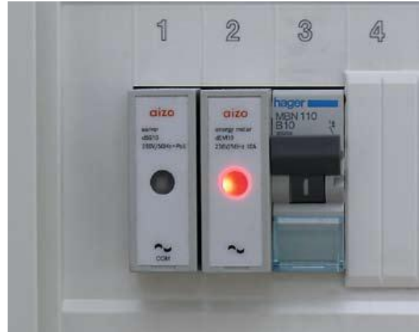
Addition to the Digitalstrom installation: Web server and Meter.