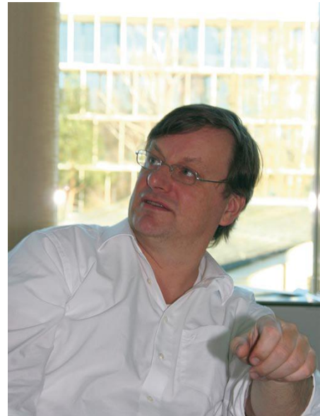
Figure 3 «It becomes easier for electricians; they do not assign the lamps until after the apartment has been completed».

The pulses lasting between 10 and 100 microseconds, via which digitalSTROM communicates, result in interference at frequencies within the 5 to 50 kHz range. How does that work out if 3 billion electrical devices in Germany carry a chip like this?