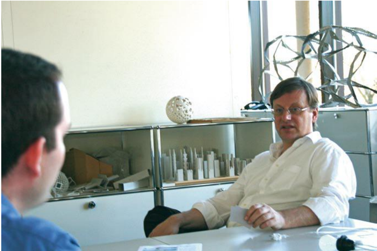
Figure 1 «digitalSTROM must be simple; it is intended to make room automation suitable for mass production.»

The digitalSTROM alliance does not build any devices itself; it advertises the technology and formulates the standard together with the partners. Aizo, our technology provider, only supplies the chip. The devices are developed by our partners, all of which should be market leaders in their respective segments.